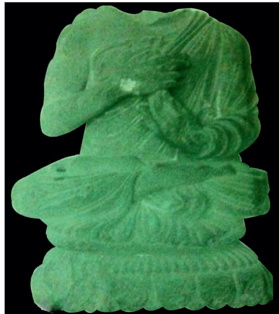
Figure 4: Buddha in dharmacakra mudrā , (After Muhammad Ashraf Khan, 2005: 67, No. 324, Catt. 89)