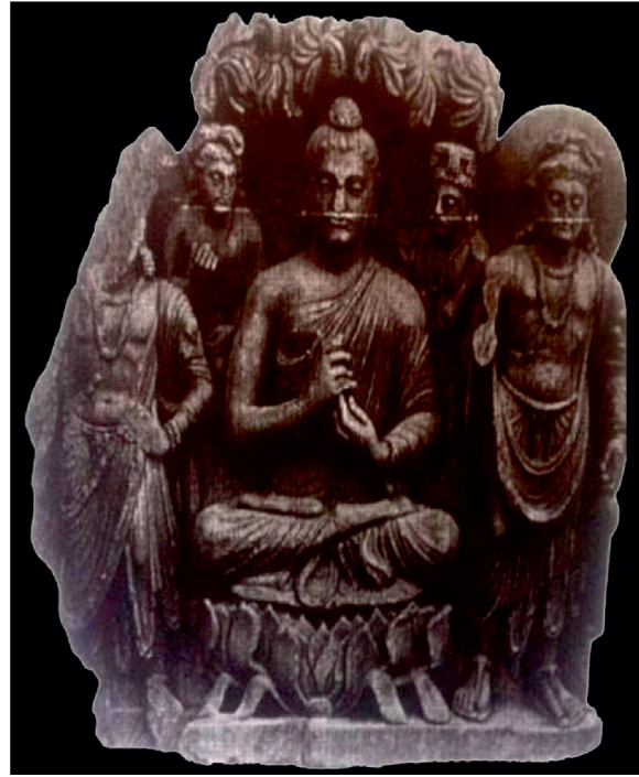
Figure 2: Buddha in dharmacakra mudrā , (After Sir John Marshall, 1960: 96, Pl. 89, fig. 124)