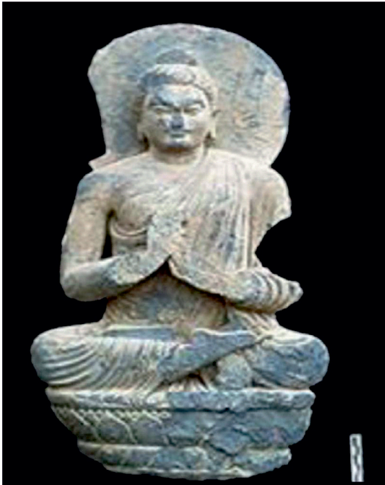
Figure 1: Buddha in dharmacakra mudrā , provenance unknown, now in Peshawar Museum Collection